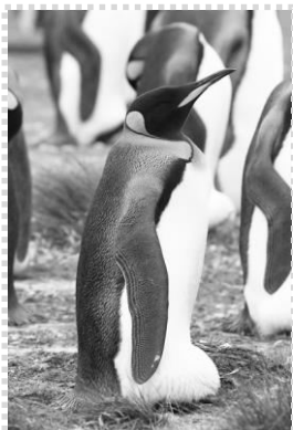
1 documentary/ soap opera