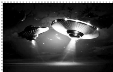
3 adventure/science fiction